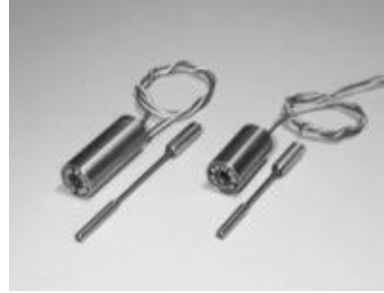
Type WLH economic, compact sensor