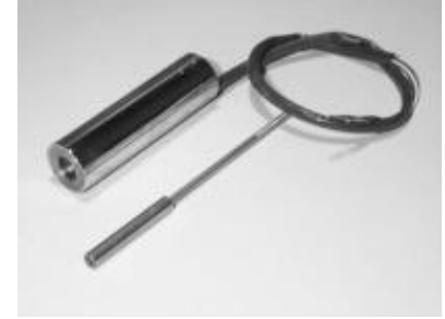
Type WV precision sensor (low-cost series)