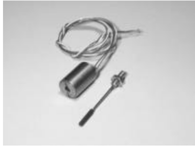
Type WM miniature version