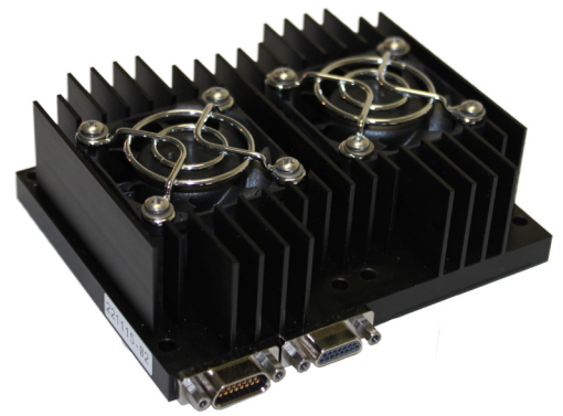
4 x 3 IntelliCool Heat Sink (P/N QSX-AC-34-HS-28V-SP) – For use with Quasonix legacy side-by-side Dual TIMTER transmitters