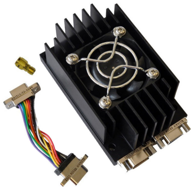
▶ 2 x 3 IntelliCool Heat Sink (P/N QSX-AC-32-HS-28V-SP) – For use with Quasonix TIMTER transmitters